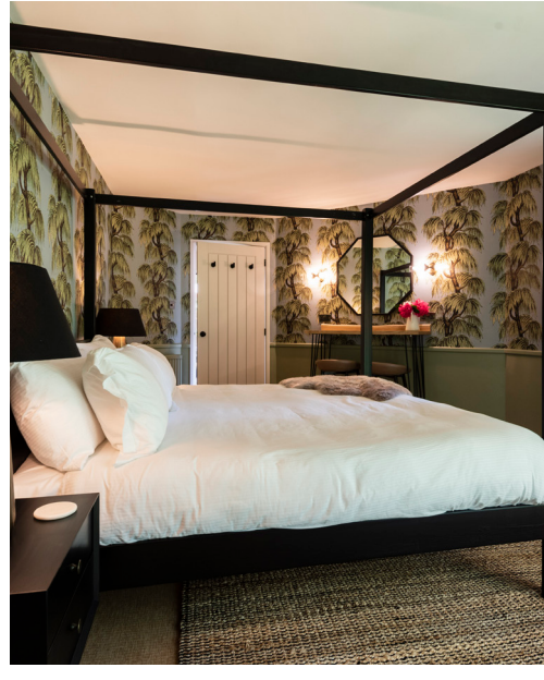
S\ T\ A\ Y\quad A\ T